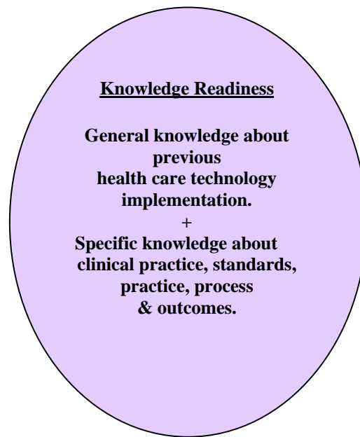
Figure 3. Knowledge Readiness Sub-component, Pickney & Huels, 2007